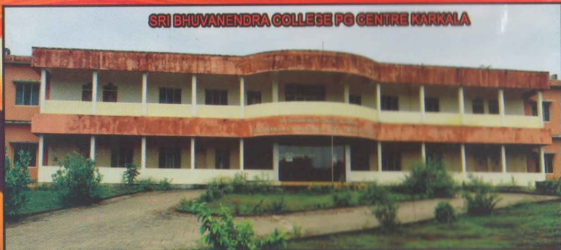
SRI BHUVANENDRA COLLEGE PG CENTRE KARKALA

Sri Bhuvanendra College is my Alma Mater. I am proud of her rich traditions and great achievements. I Pledge my devotion to her and shall always strive to be worthy of her.