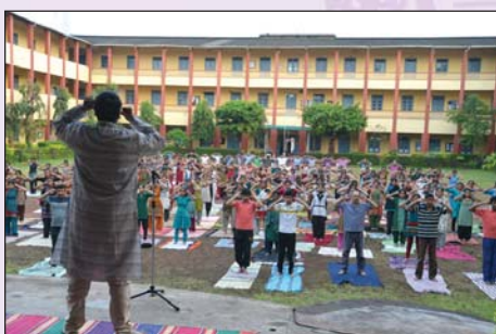
Sudarshana Kriya Yoga