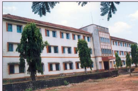
Dr. Madhava Pai Hostel (Boys)

Apart from the University examination, College conducts internal examinations. The students have to write all the examinations seriously. Proficiency prizes are awarded to the students who excel in academic work. Dr. T. M. A. Pai Gold Medal is instituted by the College for the best out going student every year.