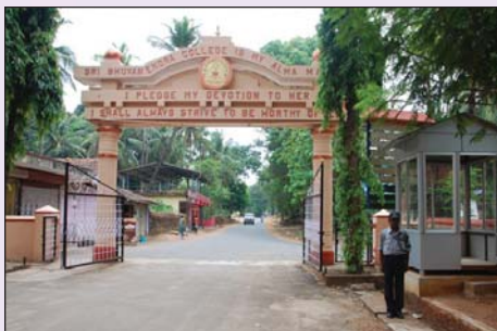
Main entrance to the college campus