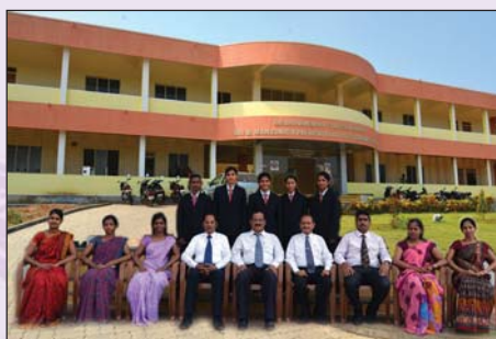
Sri B. Manjunatha Pai Memorial Post Graduate Centre