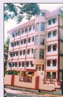
Vivekananda Hostel (Boys)