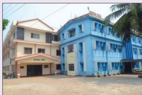
Sharada Sadana (Ladies Hostel)