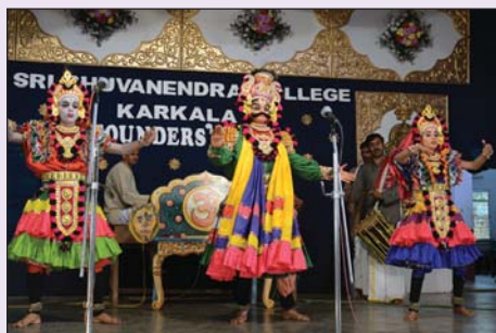
Cultural Programme by students