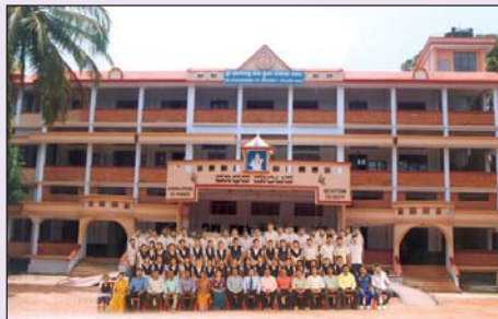
Sri Bhuvanendra P. U. College

Group II : a) HISTORY, ECONOMICS and POLITICAL SCIENCE (HEP)