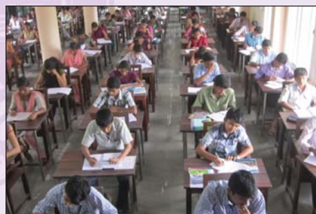
Library Reading Room