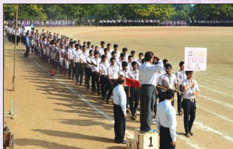
Annual Sports Meet