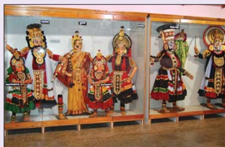
Yakshgana Museum - Indraprastha